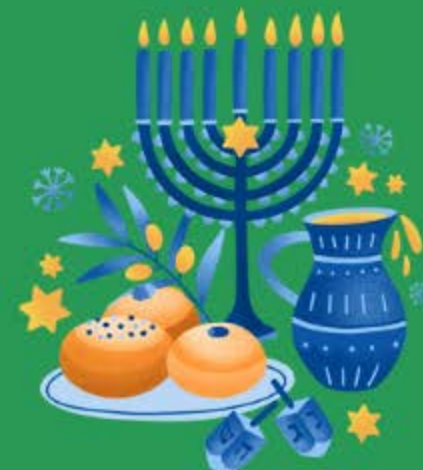
Hannukah Dec 7th - 15th

Hanukkah is a Jewish festival commemorating the recovery of Jerusalem and subsequent rededication of the Second Temple at the beginning of the Maccabean Revolt against the Seleucid Empire in the 2nd century BCE.