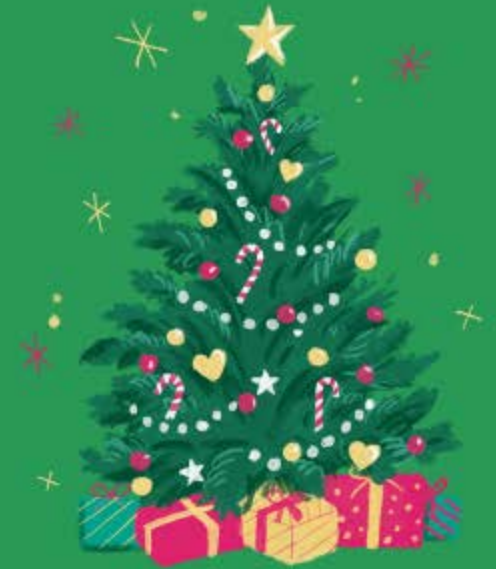
Christmas Dec 25th

Christmas is an annual festival commemorating the birth of Jesus Christ, observed primarily on December 25 as a religious and cultural celebration among billions of people around the world.