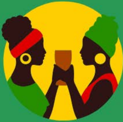
Kwanzaa Dec 26th - Jan 1st

Kwanzaa is an African American and Pan-African holiday that celebrates history, values, family, community and culture.