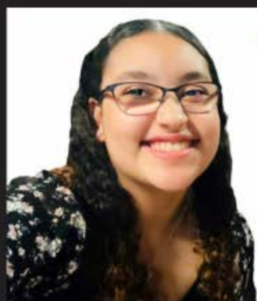
Serenity - 8th Grade